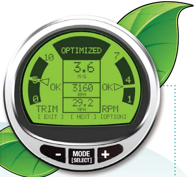
Arrow indicates best boat cruising RPM for optimum fuel efficiency Green screen indicates boat is achieving best fuel economy

Would you like to get a 10-20% increase in fuel economy? Mercury's new ECO feature allows you to do just that!